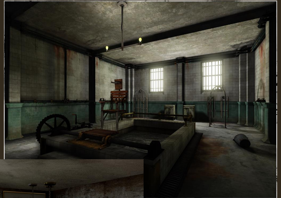
Hydrotherapy Chair Lambeth Asylum